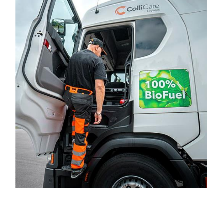
The analysis compares CO_2e emissions from various fuel alternatives in road transport.

Well-to-wheel (WTW)/Tank-to-wheel (TTW) calculation of greenhouse gas emissions has been performed according to the ISO 14083:2023 standard (Quantification and Reporting of Greenhouse Gas Emissions - Freight Transport).