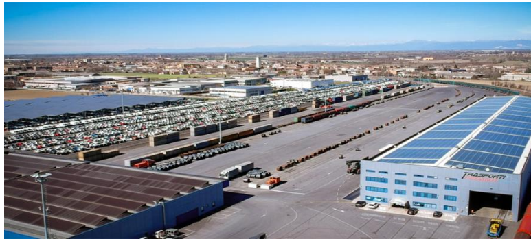
Piadena – Cremona Italy

The new rail service will be somewhat unique and the plan is to bring goods both for the Swedish and the Norwegian market, and return goods to Italy.